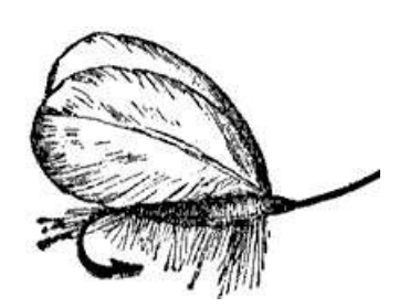
Used by permission etc.usf.edu/clipart

http://quiviracoalition.org/ 2010 Conference/index.html